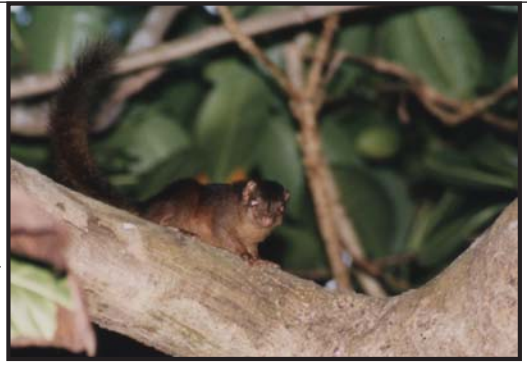
Nicobar Tree Shrew