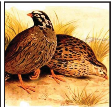
Jerdon's Courser Pink-headed Duck Himalayan Quail