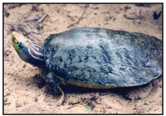
Red-crowned Roof Turtle